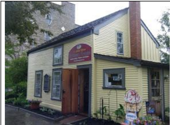
Little Yellow House